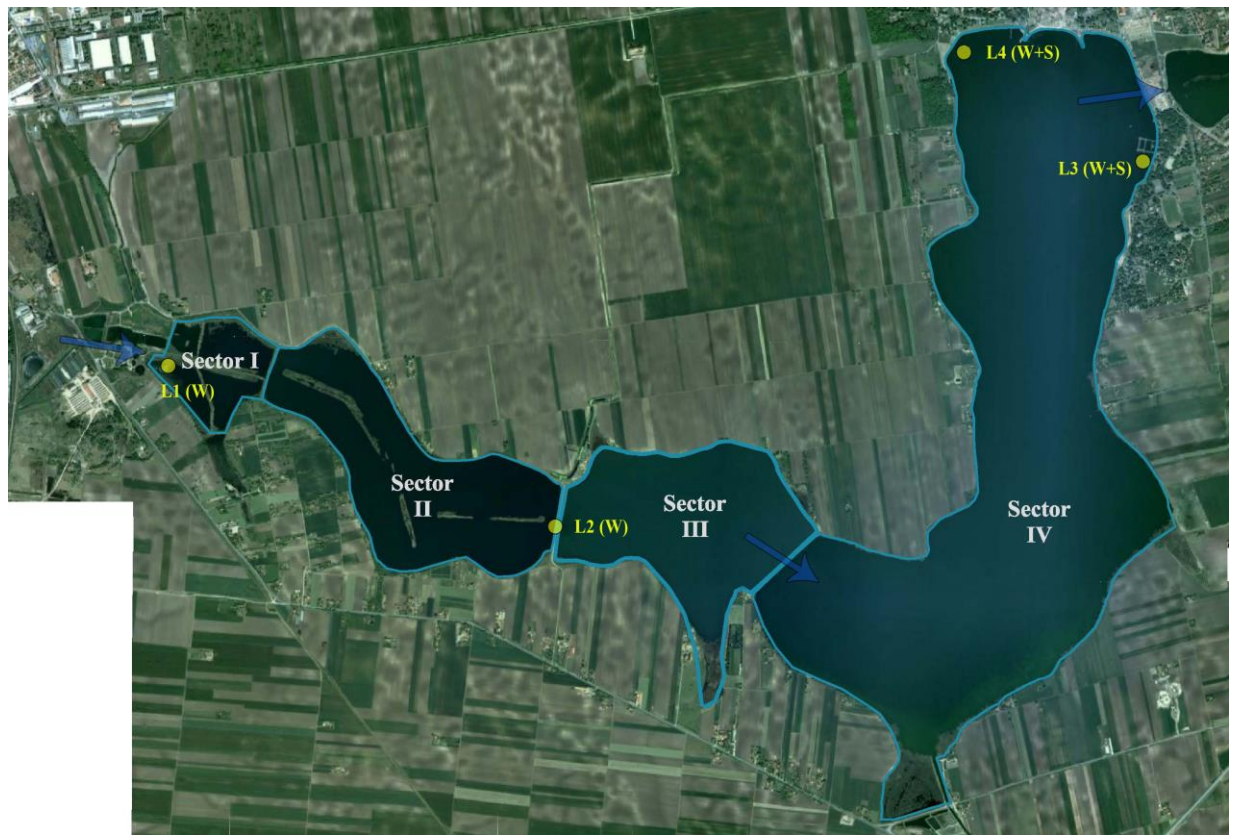
Figure 1. Sampling sites and water flow direction (W-water samples, S-sediment samples)