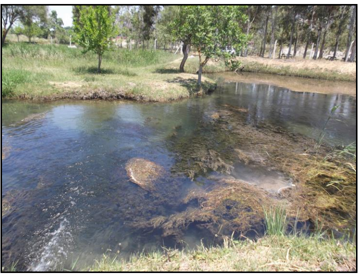
Figure 3. Bozdoğan, Aydin, Turkey.

In the aquatic environment, the availabilities of light, dissolved inorganic carbon and nutrients are critical for the photosynthesis and growth of floating-leaved plants. In competition for light, floating-leaved plants have the advantage of being unshaded by any lightreducing component of the water (Gettys, et.al., 2009). When conditions permit water plants can multiply very quickly in the environment (Figure 3).