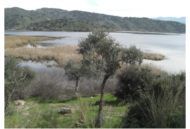
Figure 1. Lake Bafa, Aydin, Turkey

According to this aim, as the aqutic plants have great importance but do not see the value they deserve, it is decided to dwell on this subject and literature knowledge on aquatic plants particulary the floating aquatic plants in Turkey and in the world are examined and discussed due to the literature review.