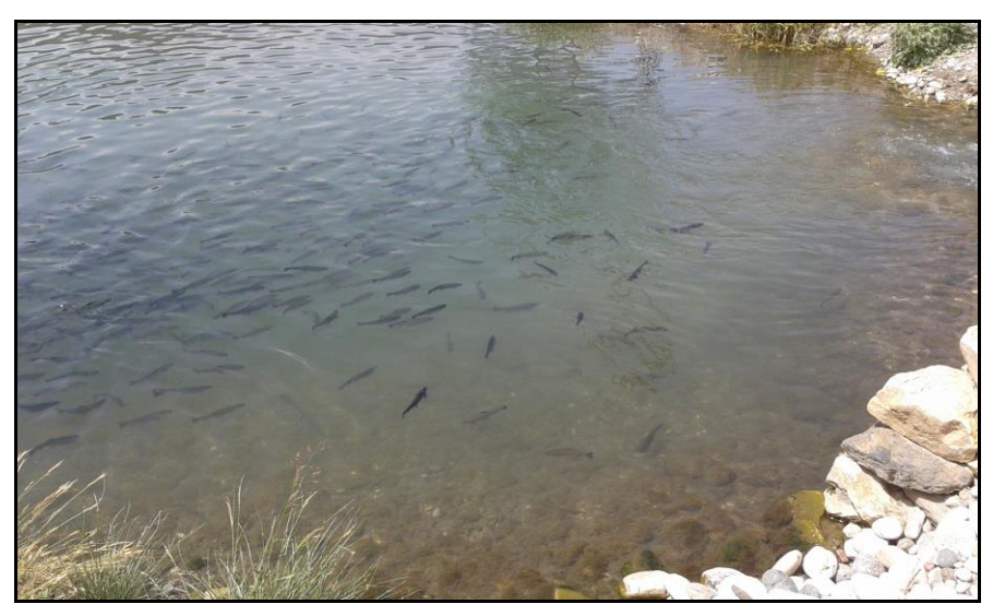
Figure 4 Fish from aquatic habitat, Aydin, Turkey.