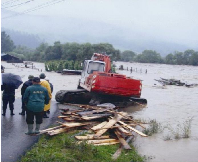
Figure. 3 The effects of 2008 floods on the Prut river in the Stanca-Costesti area

Node, which including a clay dam located between the Stanca village in Romania and Costesti on the territory of Republic of Moldova.