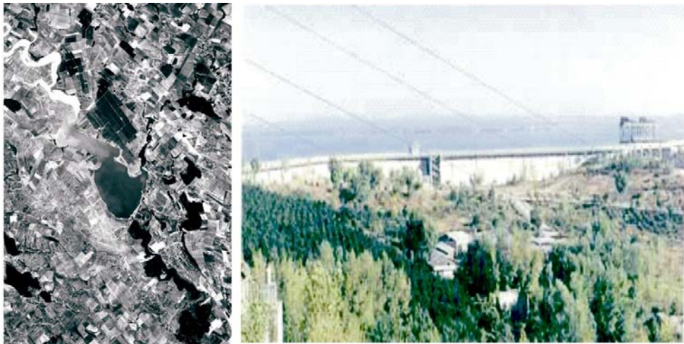
Figure 2. The position of Stanca-Costesti reservoir (left)- Landsat image and The dam of Stâncea-Costești accumulation (right)